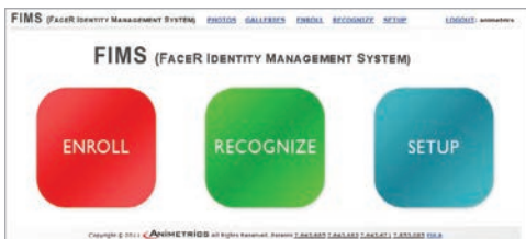
Animetrics FIMS Home Screen